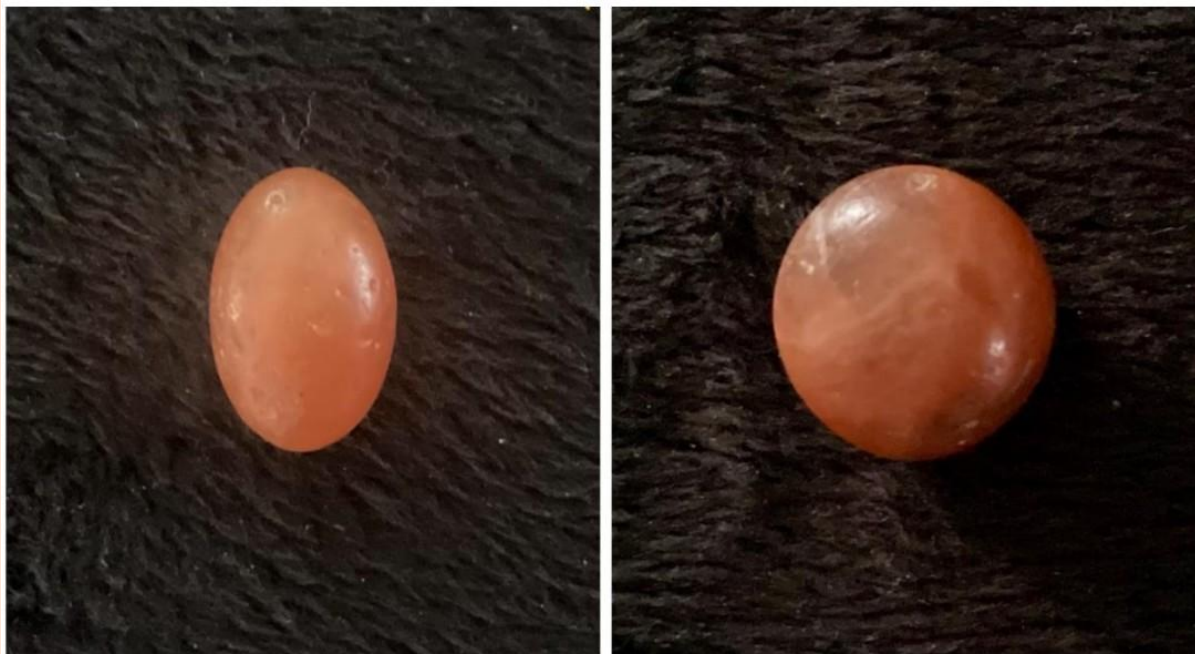
Natural agates, such as those found on the beaches of Chaleur Bay. All of the agates shown are part of the author's collection and were photographed by him.

On the beaches of Chaleur Bay in Gaspésie, Quebec, Canada, interesting small agates are found that are as yet largely unknown among collectors outside the region. They are usually between just 5 and 25 mm in size. Their external shape is typically spherical or nearly perfectly oval, resembling an agate nodule. Remarkable combinations of these two shapes are also possible.