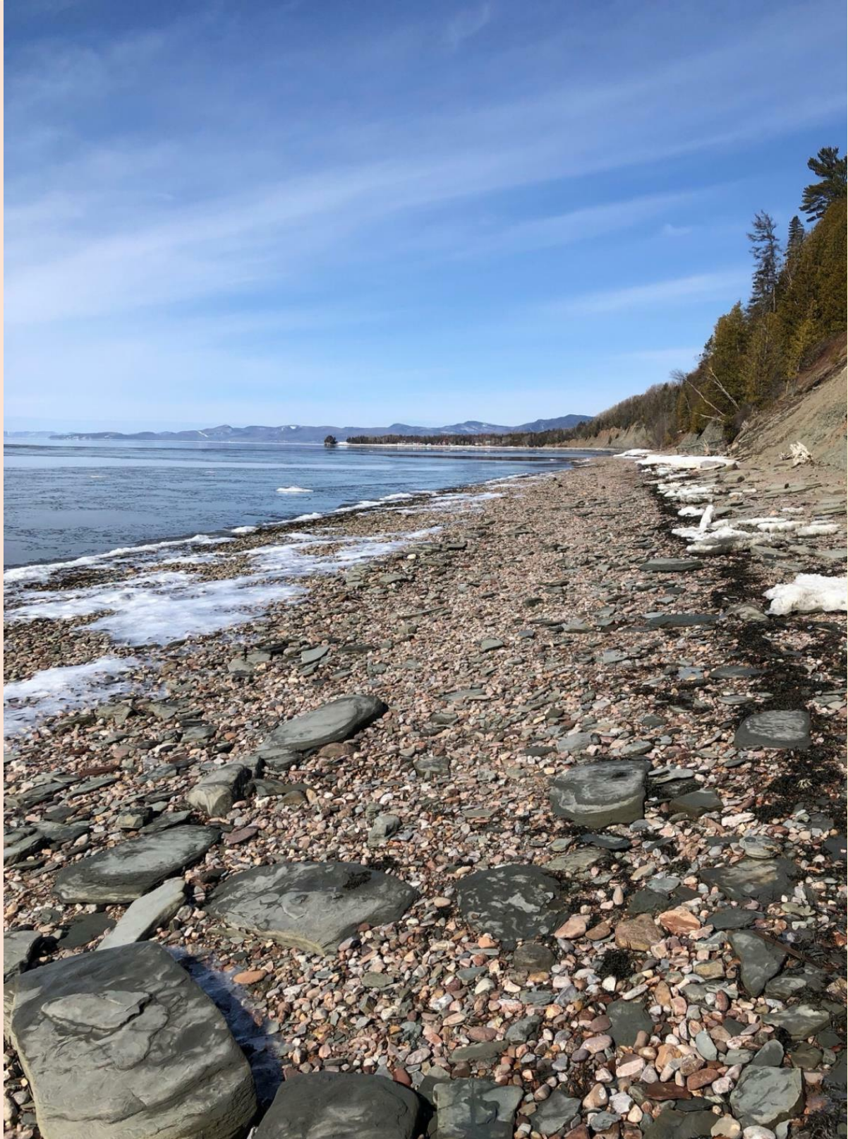
A perfect beach for agate hunting near Miguasha.