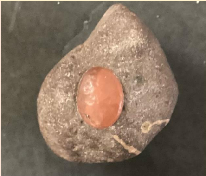
Perfect oval agate nodule (0.5 cm) in host rock. 2.5 cm.

Recent publications, including that of Mahmut MAT (2024) describe this natural formation process.