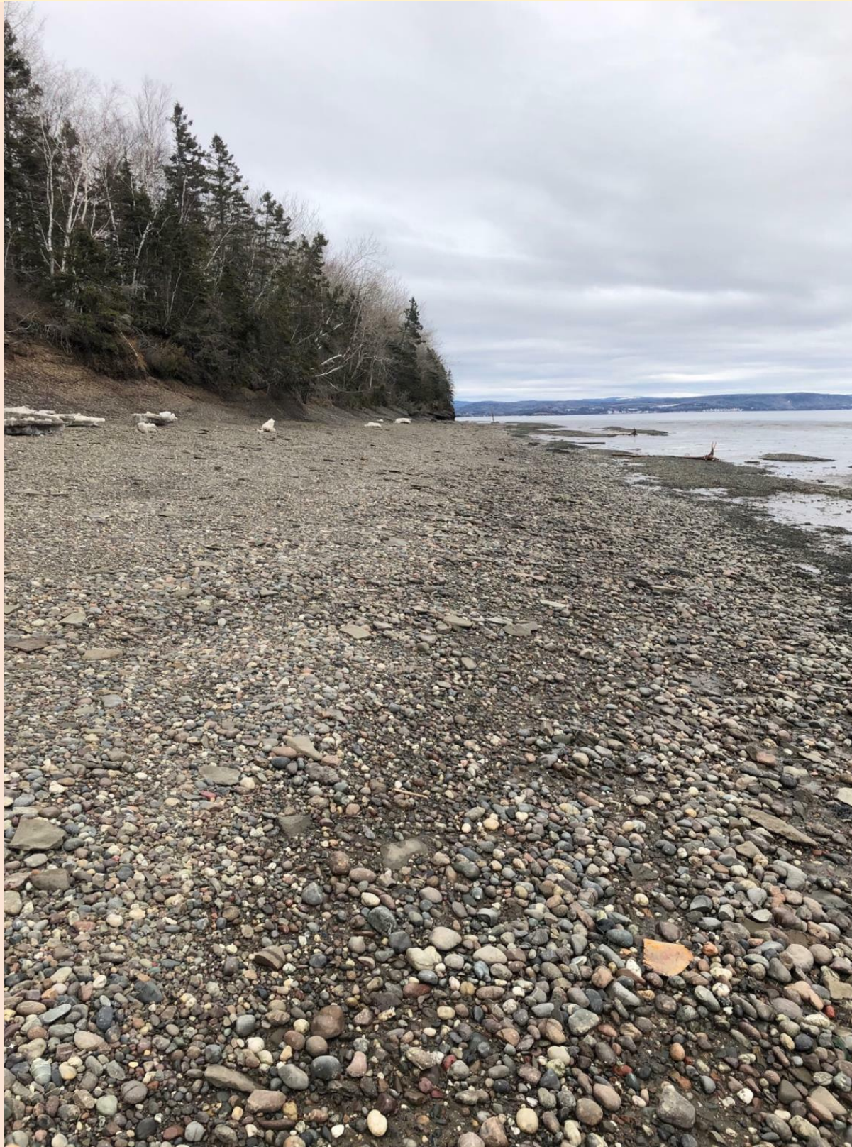
A typical cove near Carleton-sur-Mer where agates can be found.